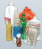
#1-2 and #4-7 Plastic containers (no styrofoam)