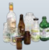
Glass bottles and jars (all colors)