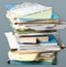
File folders, office paper and gift wrapping paper

Please follow these guidelines and set your cart out by 7 a.m. on collection day. Promptly remove your cart after pickup.