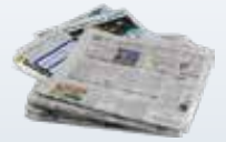
Newspapers, magazines, brochures and inserts