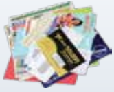
Greeting cards, regular and junk mail