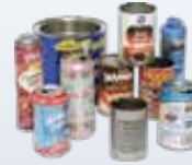
Aluminum foil, aluminum and metal cans