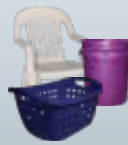
Bulky rigid plastic (buckets, chairs, toys)