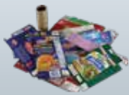
Paperboard boxes (cereal, pasta, tissue)