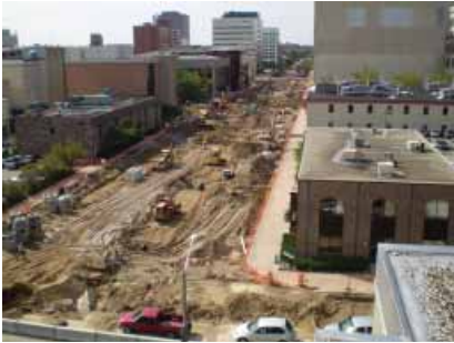
Aerial shot of Downtown Construction

CSO Control Program. Volume 1 of the Task Force Report can be viewed at www.lansingcso.com .