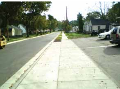
New sidewalk on Jackson Street

On Jackson Street, sanitary sewer manholes were adjusted and televising is complete. Final paving has also been completed.