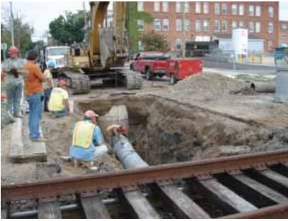
Construction work on the railroad tracks at Shiawassee Street