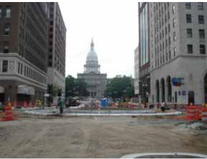
“Streetscape” Construction on Michigan Avenue