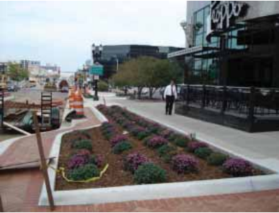
Seasonal mums on Michigan Avenue

Rain garden construction continues on the south side of Michigan Avenue. The rain gardens in the 800 and 900 blocks are expected to be completed at the end of October.