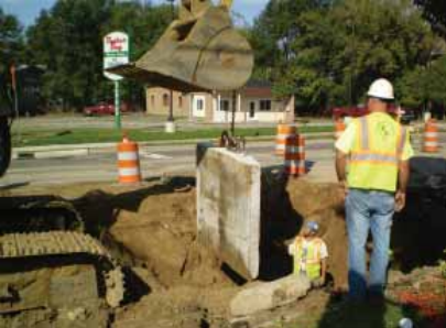
Thrust block at Oakland and Pennsylvania