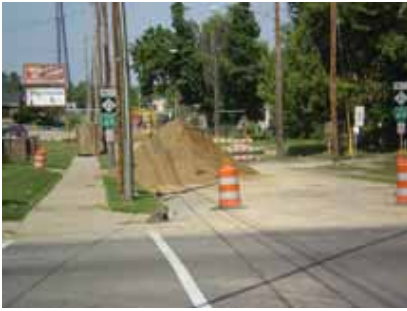
Oakland Avenue Construction