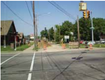
Oakland Avenue Construction

Due to construction, Pennsylvania Avenue is now down to one lane of northbound traffic and one lane of southbound traffic. In addition, the closure of Oakland Avenue continues as planned. This major westbound roadway is expected to remain closed to through traffic until mid-November. Westbound traffic on Oakland Avenue will be detoured northwest (right) onto Grand River Avenue and then south (left) onto Cedar Street to return to Oakland Avenue. Motorists may encounter delays and are advised to seek alternate routes whenever possible.