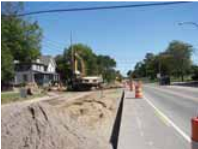
Pennsylvania Street Construction

Regarding Haag Court, the storm sewer has been constructed, and construction on the new water main should be completed there in about two weeks. The Lansing Board of Water & Light will commence work to move the electric utility poles. This effort is roughly a four-week process. It requires the cable TV company, the telephone company, and telecommunication companies to also transfer their lines from these utility poles. Following this activity, sanitary sewer construction can begin.