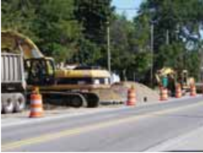
Pennsylvania Street Construction

In “Dumpster Alley” (the alley-way between Allegan Street and Washtenaw, west of Washington Square), the dumpster pad should be installed on June 21. Paving of the alley should occur in early to mid July.