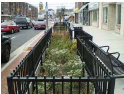
Rain garden - 600 block Michigan Avenue

The concrete and brickwork on the south side of the 300 and 400 block of E. Michigan is nearing completion. With the exception of 316 E. Michigan, the work on this street will be completed prior to Silver Bells in the City.