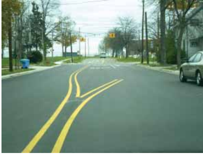
Shiawassee final pavement and markings south of Pennsylvania