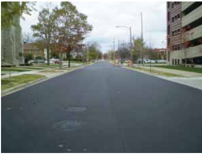
Downtown Seymour Street final pave