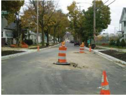
Manhole work on Ballard