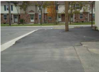
Final pave and parking lot for business at Turner and Carrier