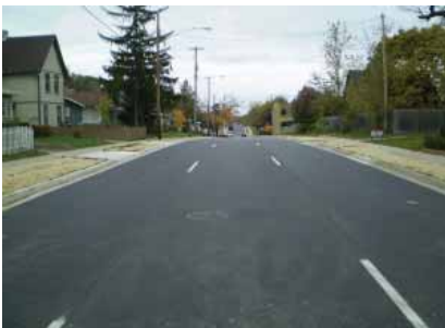
Oakland - Final pave and now open to traffic