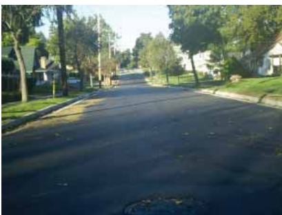
Final pave Randolph Street