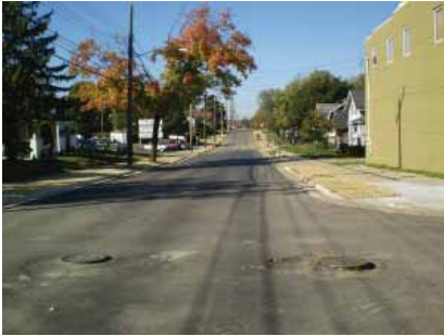
Base pave on Oakland Avenue