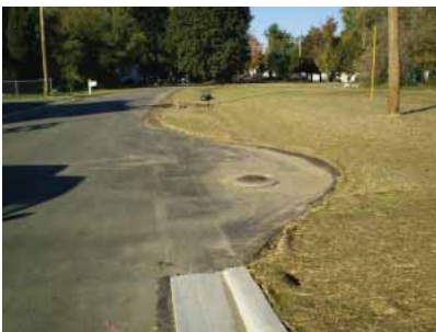
Catch basin and restoration on Carrier Street