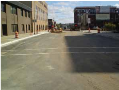
Downtown Kalamazoo base pave east of Capitol Avenue