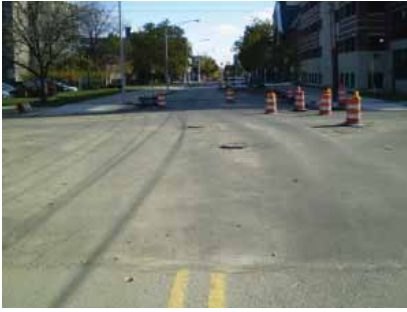
Downtown pave and manhole on Seymour Street and Ionia