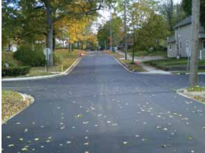
Final pave at Genesee Street and Dorrance Street