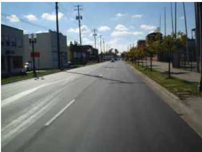
Final pave on Larch Street