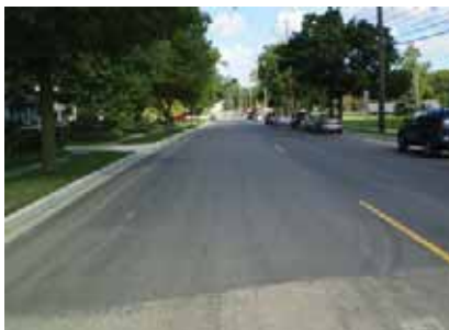
New asphalt in Filley Street

The construction of the sanitary sewer and the associated manhole north of the Kalamazoo / Washington Square intersection is complete. Although there is some watermain and steam utility work remaining in this intersection, this work is due to be completed in approximately two weeks. Construction of the