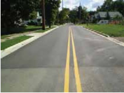
New pavement and markings on Taylor Street

Grand River Avenue, new watermain and storm sewer are currently being constructed. Following completion of this work, paving of Case Street, Ballard Street, and Porter Street (east of Ballard Street) will begin.