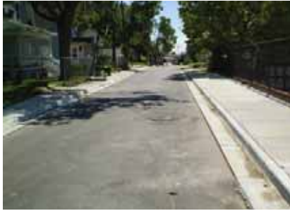
New curb and gutter on Hill Street

sanitary service leads in the east 100 block of Kalamazoo Street is underway (the west 100 block is complete).