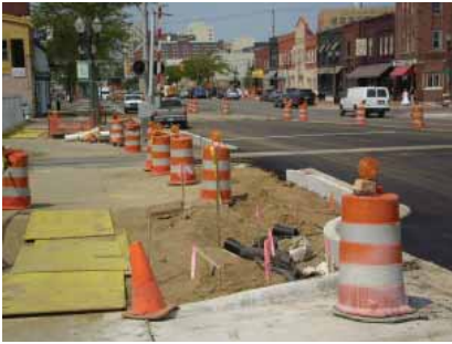
Rain Garden Preparation

Construction of the median planter islands on Michigan Avenue between Grand and Capitol avenues continues. All underground construction is done except for the work in the Michigan/Washington intersection. Construction continues on the new north-south pedestrian crossings in the intersection. When these crossings are complete (expected to be August 13), construction will start on the Michigan/Washington intersection. Construction in the intersection will take 4 to 6 weeks. No traffic will be allowed through the intersection during construction. Access to local businesses will be maintained (be sure to check out the new wayfinding signs). Pedestrian crossings will be maintained at the intersection.