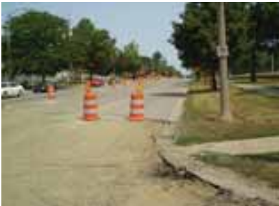
Pennsylvania Street Traffic Control

The utility poles on Haag Court have been moved from the east side to the west side. It will take 2 to 3 weeks to transfer the utilities to the new poles. Underground construction will restart when all utilities are off the old poles. Construction should be finished by October.