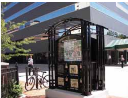
Washington Square Kiosk

Construction of the 24-inch storm sewer in Oakland Avenue is finished. All underground utility work in the segment of Oakland Avenue between Ballard Street and Pennsylvania Avenue is now complete. Road-building activities have begun in this segment of Oakland Avenue.