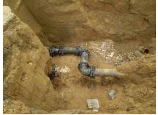
Water Service Connection