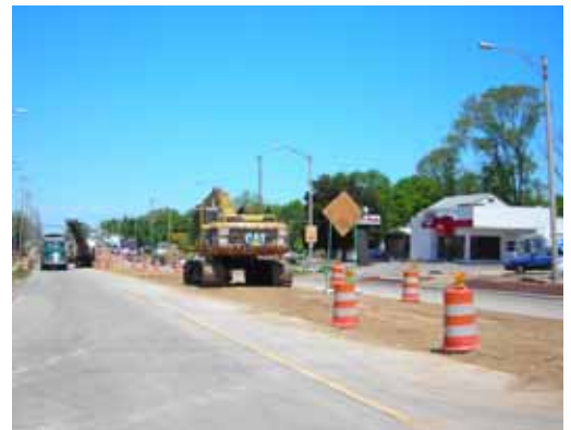
013NE Pavement Removal on N East at Chilson