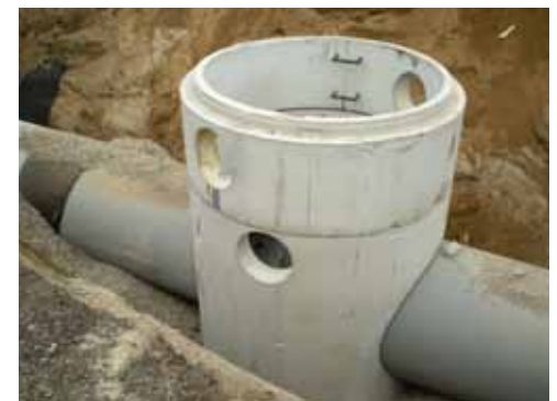
018SW Storm Sewer and Manhole Installation