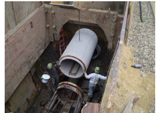
42-inch bore at Grand and Michigan Avenue