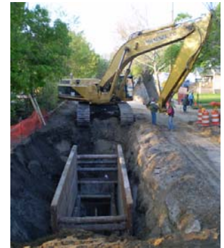
Osband and Cooper Sewer Installation