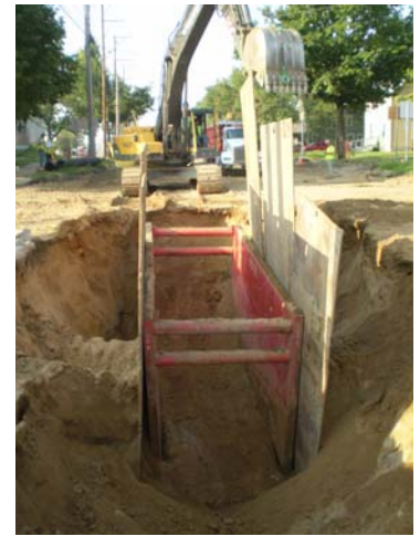
Sanitary Sewer Main Installation on Larch, south of Oakland