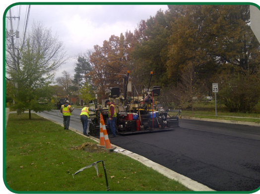
Final paving on Pine